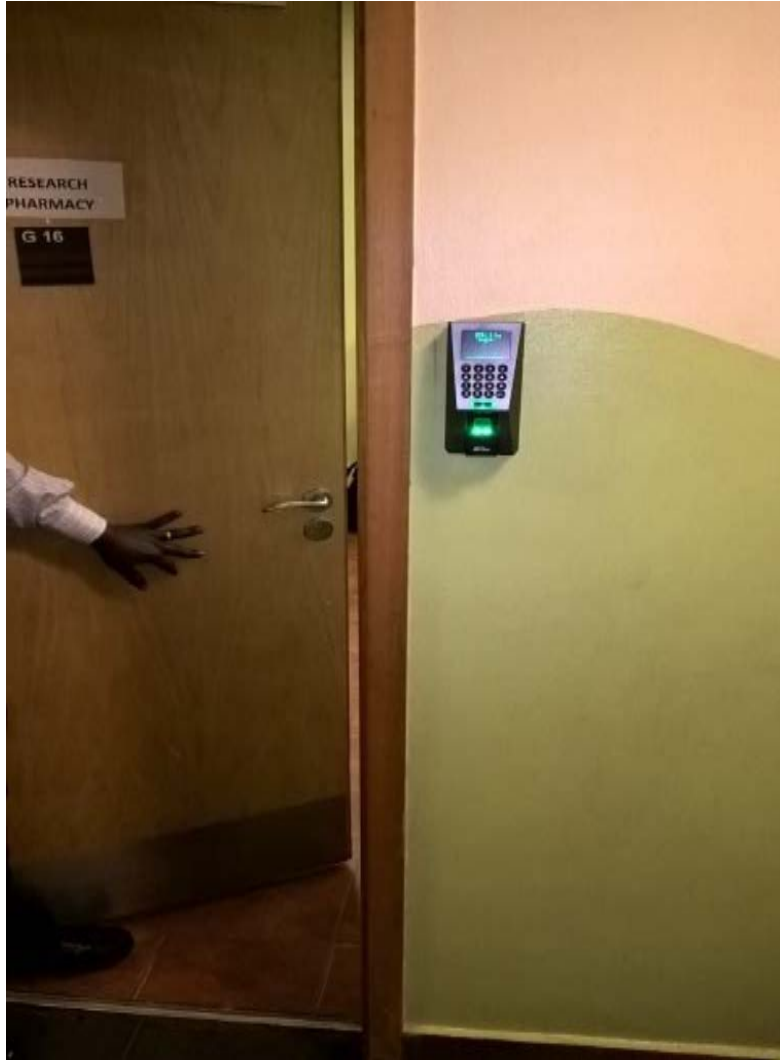
Restricted entry/biometric system