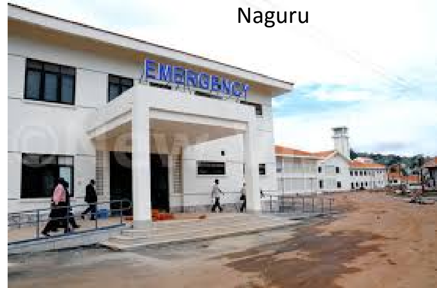
China-Uganda Friendship Hospital- Naguru