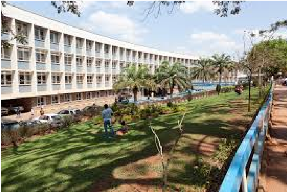
Mulago National Referral Hospital