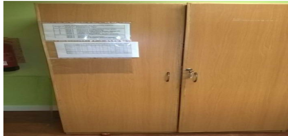
• Double lockable cabinet